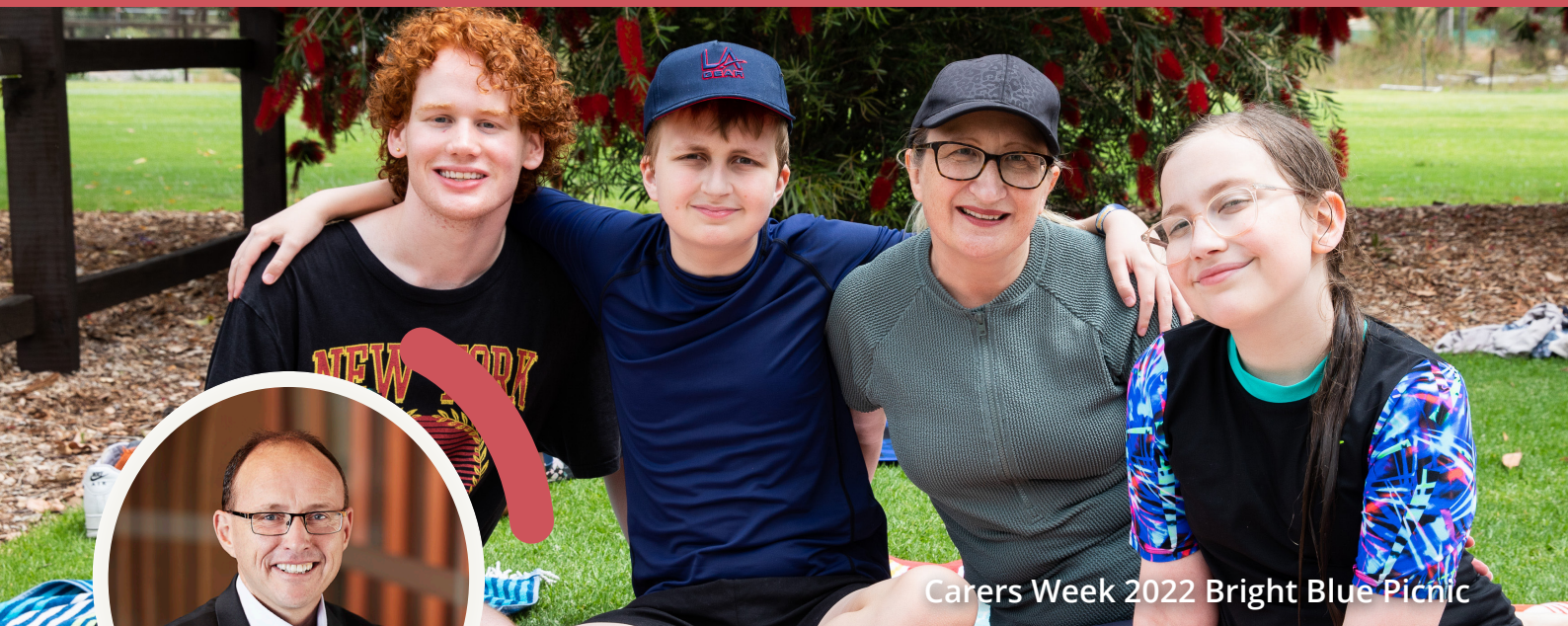
Carers Week 2022 Bright Blue Picnic