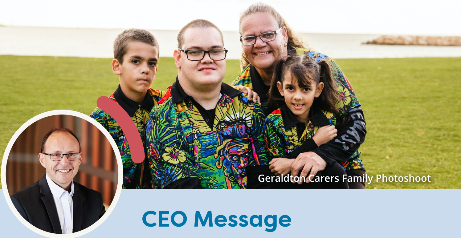
Geraldton Carers Family Photoshoot