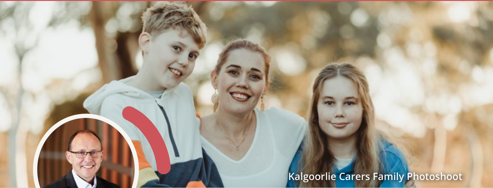
Kalgoorlie Carers Family Photoshoot